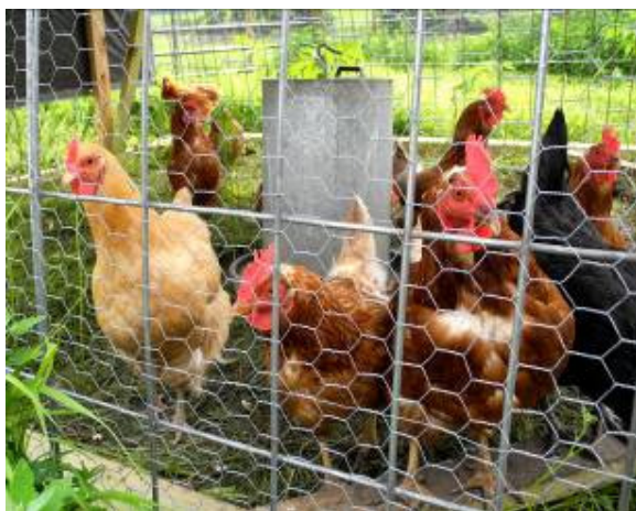
Figure 2. Quality feed and clean water will help keep birds healthy and productive.

Feed consumption may increase in the winter when burning more calories, and decrease in the heat of the summer. A critical part of a chicken's diet is continual access to clean, fresh water. This is especially true in the summer as they cool themselves by panting.