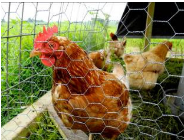
Figure 1. New Hampshire Red and Buff Orpington hens

As people are becoming more and more interested in knowing where their food comes from, the trend of raising backyard chickens is growing. Raising backyard chickens can be a rewarding experience and a great way to teach kids about nature, agriculture, and responsibility of caring for animals. Since most backyard chickens are raised for laying and not for meat, this factsheet will focus on layers.